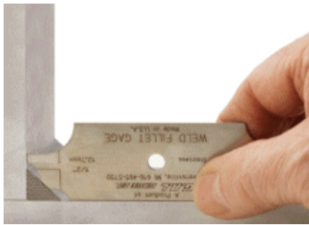
Checking Fillet Throat Size