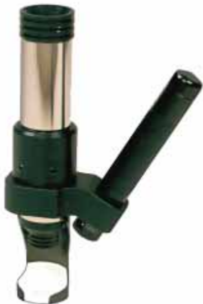
Model 35-450 Brinell Microscope Reader Calibrated microscope for measuring Brinell indentations in millimeters