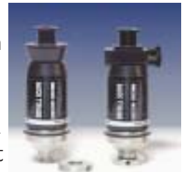
HiLight Series Brinell Scopes