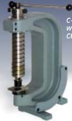
C-clamp with CP-100