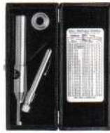
Microscope in case